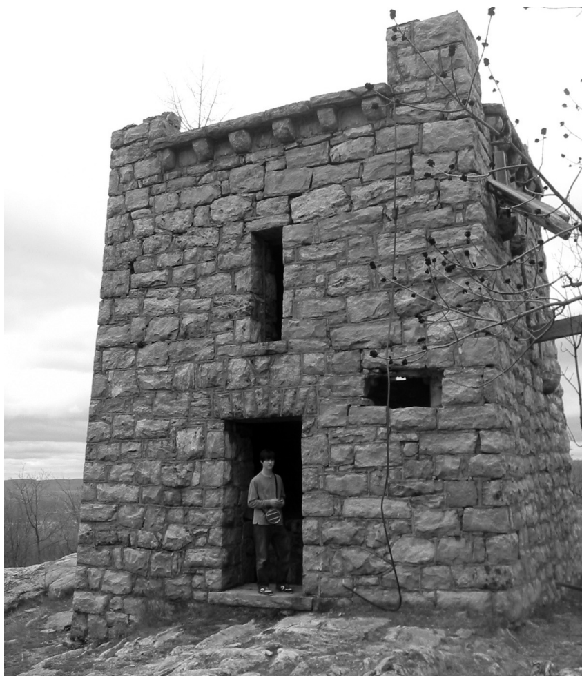
Stone water tower

A short distance beyond, the Castle Point Trail reaches a paved road, with Skyline Drive just to the left. Here, the Castle Point Trail ends, and you turn right to continue along the Cannonball Trail (white-“C”-on-red blazes). The trail follows the road for 200 feet, then turns left onto a footpath through the woods. Soon, you’ll reach a junction where the red/white-blazed Skyline Connector Trail begins to the left. Turn left and follow this red/white trail along a footpath roughly parallel to Skyline Drive until you reach the parking area where the hike began.