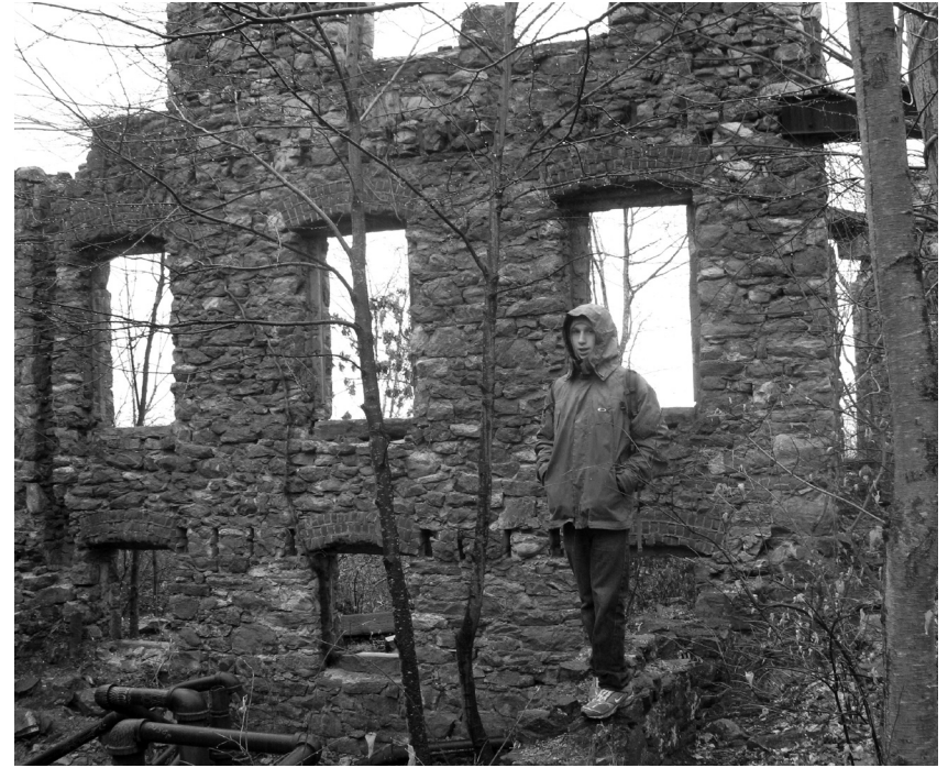
The ruins of Foxcroft

The trail continues to the north, passing the remains of a concrete swimming pool. A short distance beyond, an unmarked side trail to the