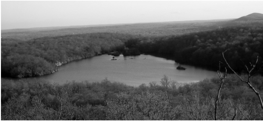
View of Ramapo Lake from a rock ledge along the Castle Point Trail

Rotten Pond, and later as Lake LeGrande, Ramapo Lake is the centerpiece of Ramapo Mountain State Forest. It was formerly surrounded by private property, but most of the land around the lake was acquired by the state in the 1970s.